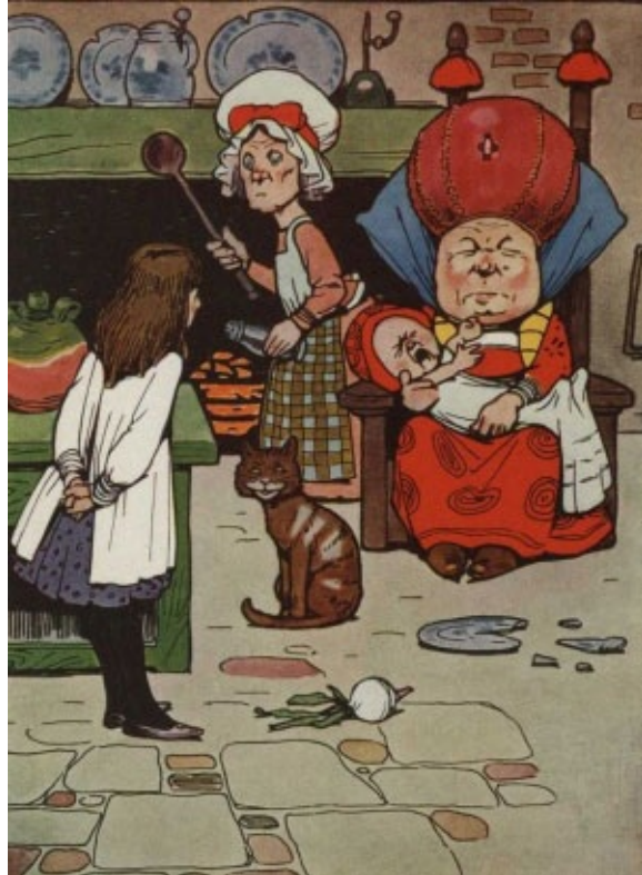
Alice in the Room of the Duchess.

by SAM'L GABRIEL SONS & COMPANY NEW YORK